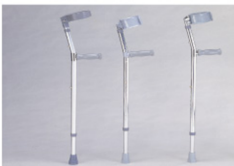
TOP-0590B TOP-0590A TOP-0590C