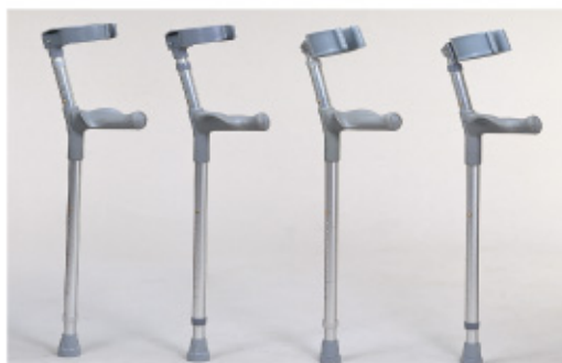
TOP-0590D TOP-0590E TOP-0590F TOP-0590G